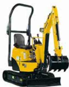
1t Excavator (Width 680mm)

At Kelm Hire, we offer a wide range of excavators to suit all your excavation needs. From small-scale projects to large-scale construction sites, we have the right equipment for the job. All excavators come with extra attachments such as hydraulic grabs, breakers, auger drive units and drill bits to suit, sleeper grabs and much more.