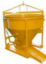
Concrete Kibble Bucket 1m & 1.5m Cube