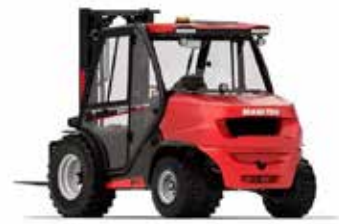
2.5 Tonne Buggy Manitou Forklift