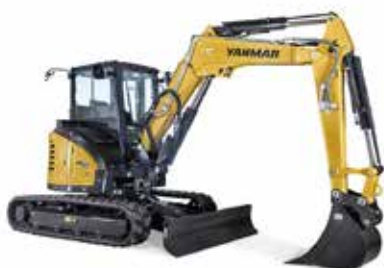
5t Excavator (Width 2m)