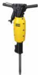
Air Breaker 27KG