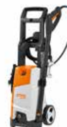
2000 PSI Electric Washer