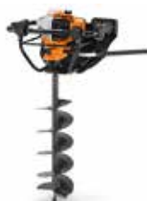
Post Hole Diggers