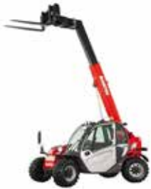
2.5 Tonne Manitou Telehandler (6m Reach)