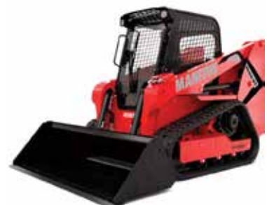
1050RT & 1650RT Manitou Posi Tracks