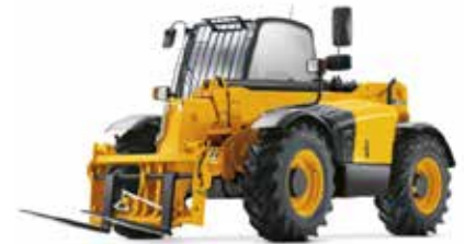
3 Tonne JCB Telehandler (12m Reach)