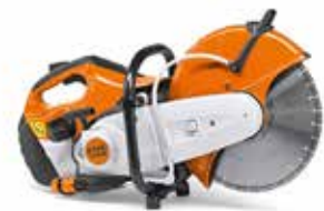
Demolition Saws 14 & 16 Inch