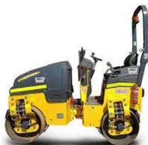
Smooth Drum Rollers