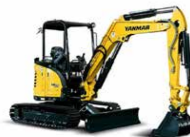
3.5t Excavator (Width 1.5m)