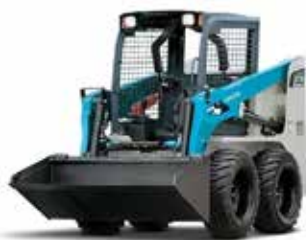
1.8T Toyota Bobcat

Kelm Hire offer a wide range of Posi-Tracks and Bobcats, two of the most versatile and popular types of compact tracked and wheeled loaders in the industry. With exceptional manoeuvrability and power, these machines can handle a wide range of tasks.