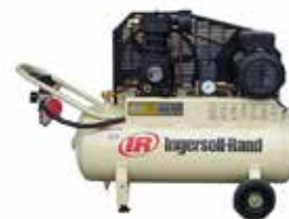
17 CFM Compressor