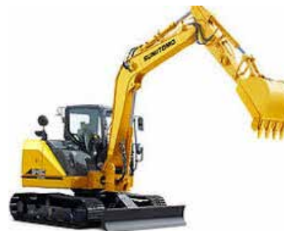
14t Excavator (Width 2.49m)