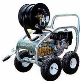
3000 PSI Pressure Washer