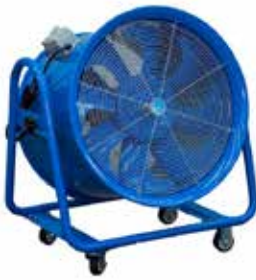
600mm Extraction Fan