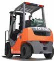
2.5 Tonne Toyota Forklift

Our top-of-the-line Manitou and JCB Telehandlers are designed to excel in even the most challenging work environments. With exceptional performance and durability, our forklifts are the perfect solution for heavy-duty industrial applications.