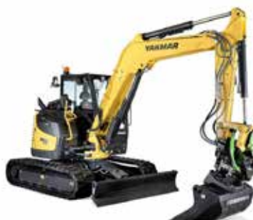
8t Excavator (Width 2.3m)