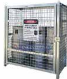
Gas Cage / First Aid Cage / Crane Boxes