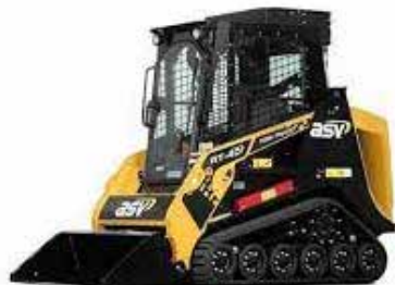
ASV Posi Tracks