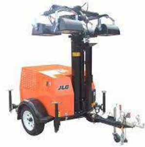
JLG Light Towers