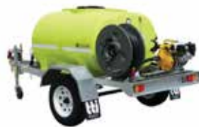
Towable Water Cart