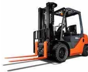
3.5 Tonne Toyota Forklift