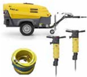
175 CFM Towable Compressor