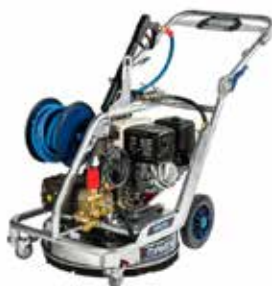
4000 PSI Rotary Walk Behind Pressure Washer