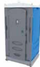
Portable / Chemical / Plumbable Toilet