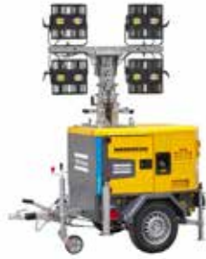
LED Directional Light Tower