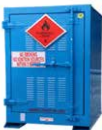
Outdoor Flammable liquids storage 160L