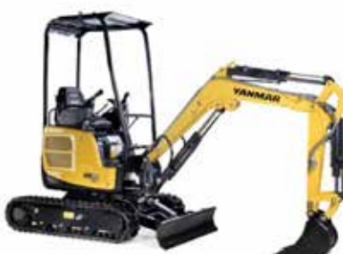
1.7t Excavator (Width 950mm)