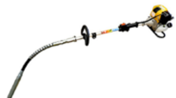
Portable Vibe Shaft