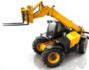
2.5 Tonne JCB Telehandler (6m Reach)